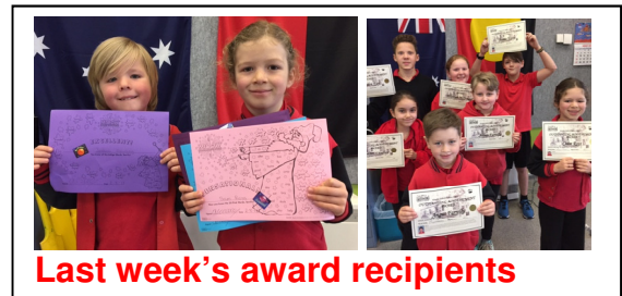
Last week's award recipients

CURRICULUM DAY Friday 11 th August No Students required at school